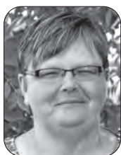
PRODUCTION Nicole Kapusta