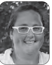
DISTRIBUTION Christy Brown