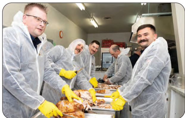
Firefighters carved 24 turkeys for dinner.

The evening concluded with live music by local band Ryes & Shine, along with raffles and a variety auction featuring prizes donated by area businesses.