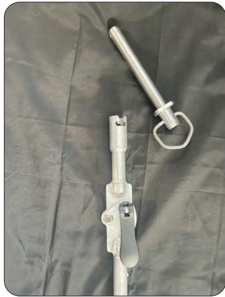
The Drawhand is a handheld extendable tool that allows an operator to insert a hitch pin from the cab of a tractor.

Once the hitch pin was finally in place, the concept for The Drawhand took shape. The all-aluminum tool holds the full hitch pin at one end and is designed to be used through the rear window of a tractor cab. After backing up to the implement, the