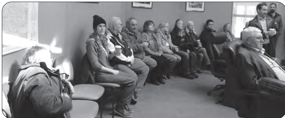
About 20 people attended the April 8 Rockwood council meeting to observe discussion and votes on proposed quarry developments.