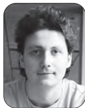
REPORTER/PHOTOGRAPHER Kieran Reimer