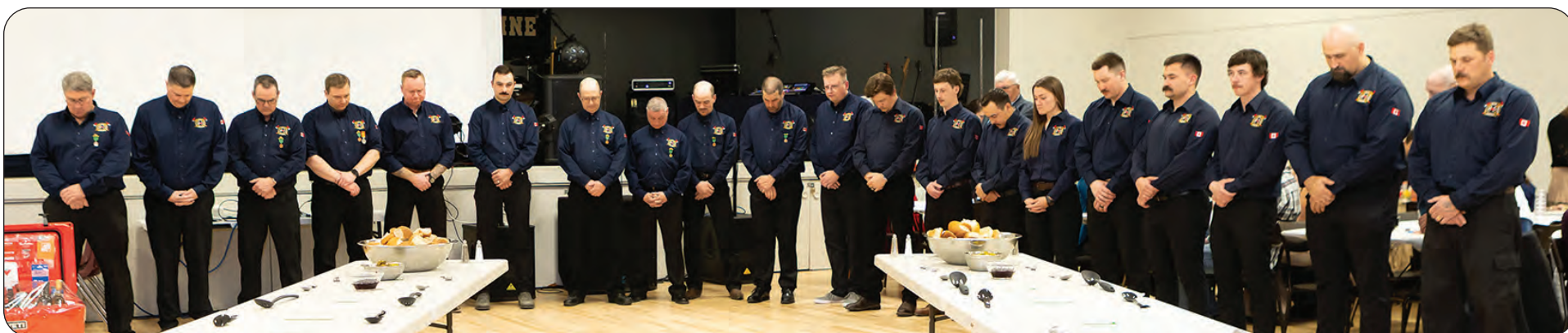
The Teulon Rockwood Fire Rescue department was introduced followed by the Fire Fighters' Prayer.