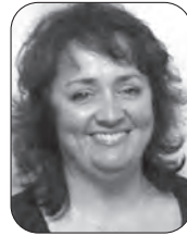
PRODUCTION Debbie Strauss