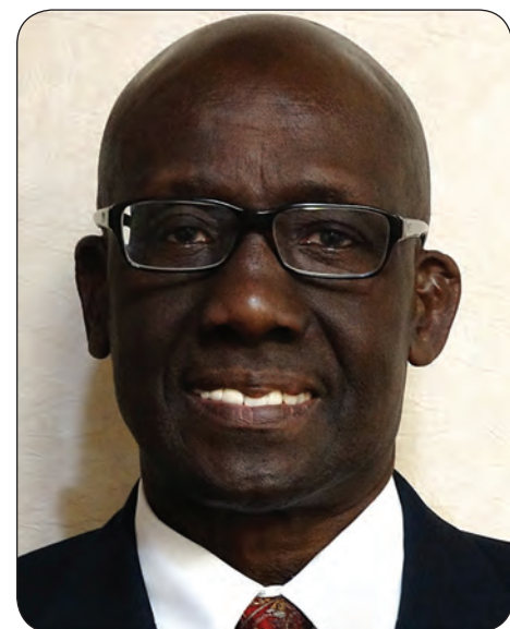
Stonewall Mayor Clive Hinds

Hinds sees the Black Lives Matter movement sparking a major change in the way people view and judge