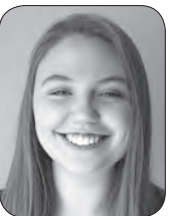
REPORTER/PHOTOGRAPHER Sydney Lockhart