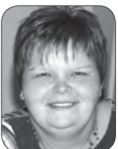
PRODUCTION Nicole Kapusta