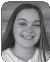
REPORTER/PHOTOGRAPHER Becca Myskiw