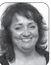
PRODUCTION Debbie Strauss