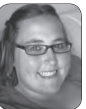
DISTRIBUTION Christy Brown