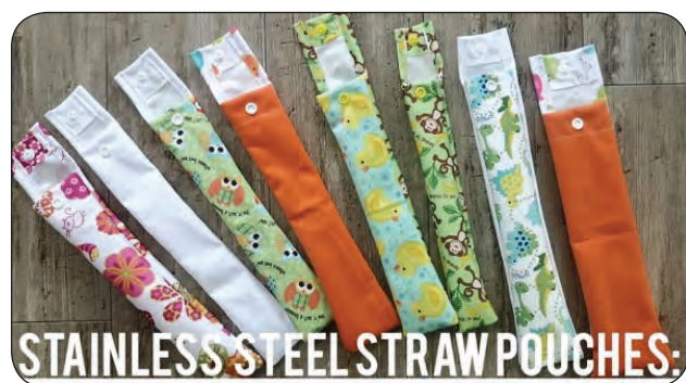
MISS B HAVEN BOUTIQUE

"I'm always looking at growth and branching out even further especially now that craft sales have been cancelled because of COVID," she said. "Because my product is popular, it can help get people